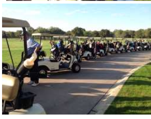
Knights of Columbus Council 15240 Annual Golf Tournament Benefiting Scholarships Held at Republic Golf Club on 11/9/2015