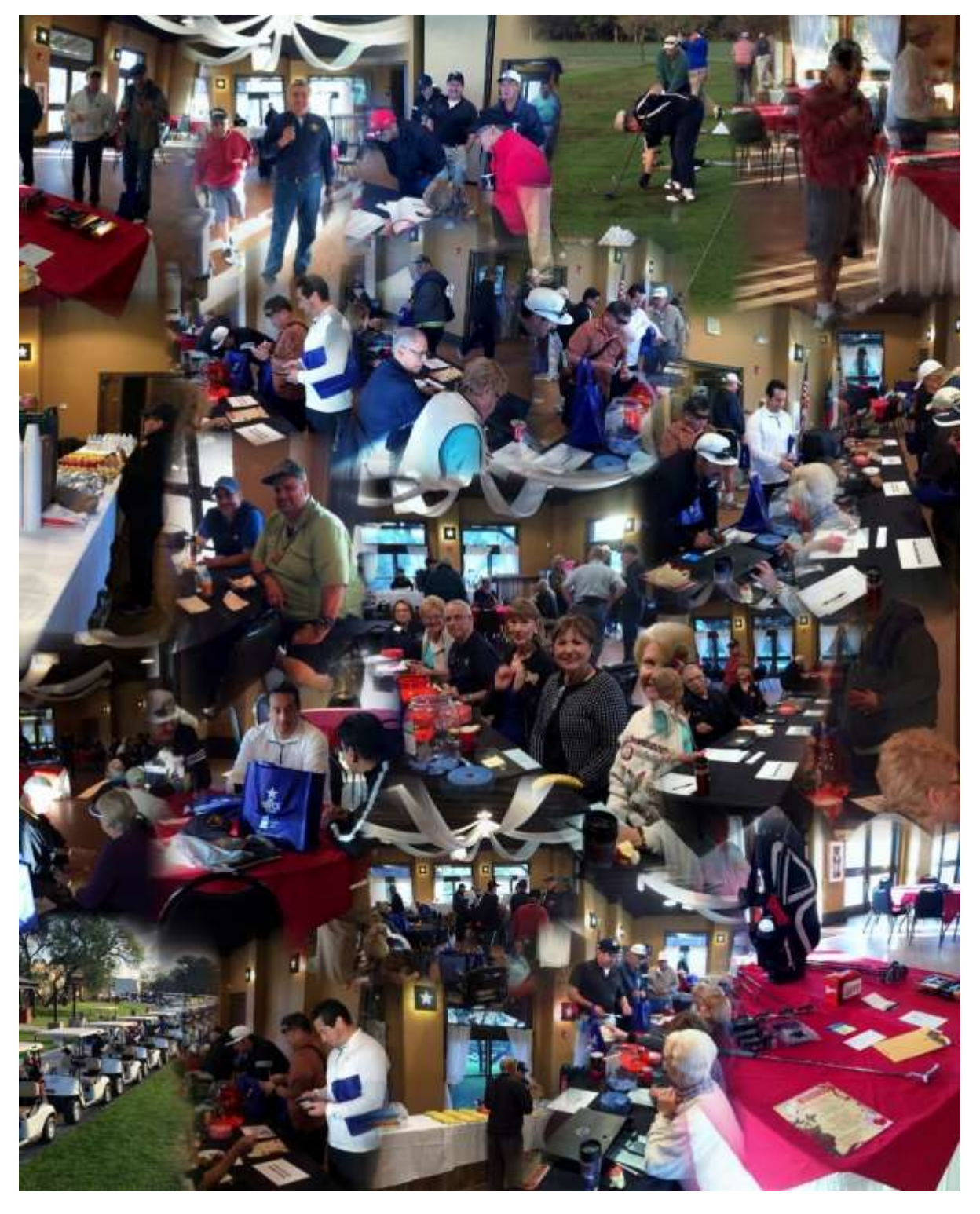
2015 COUNCIL GOLF TOURNAMENT WAS A BIG SUCCESS!